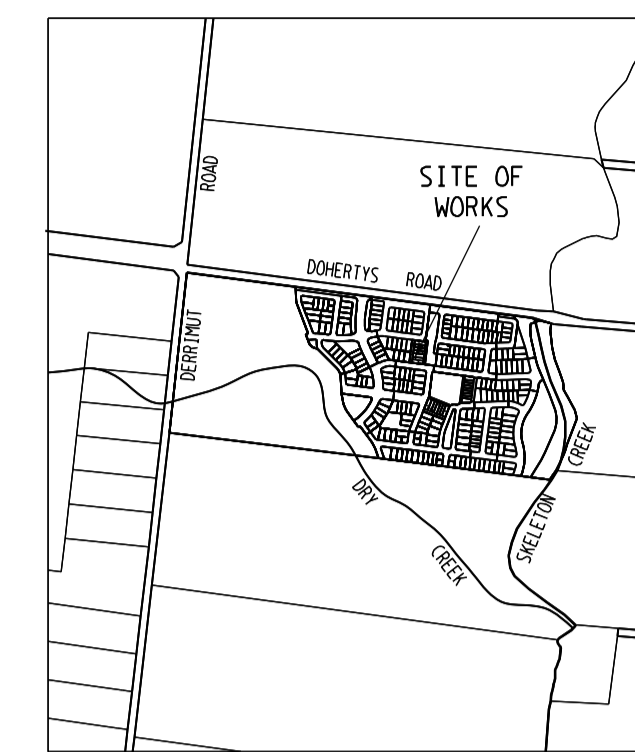
LOCALITY PLAN SCALE 1:20000

ATTENTION TO CONTRACTOR 1. IT IS THE CONTRACTORS RESPONSIBILITY TO ENSURE THAT THE DIGITAL PLAN, PROVIDED FOR SETOUT PURPOSES, MATCHES THE TBM COORDINATES SHOWN. 2. Contractor to ensure that the site is pegged and or set out checked by the licenced surveyor responsible for certifying the Plan of Subdivision prior to underground infrastructure being installed. 3. Where concrete works about a sewer access chamber surround or similar structure, an expansion joint of approved material shall be provided between the two faces.