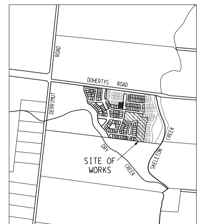
LOCALITY PLAN SCALE 1:20000