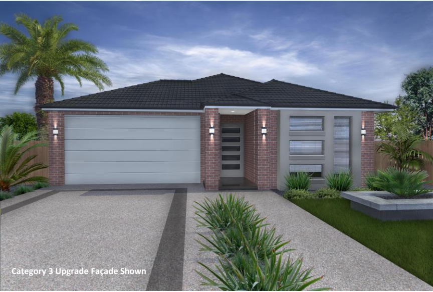
Category 3 Upgrade Façade Shown