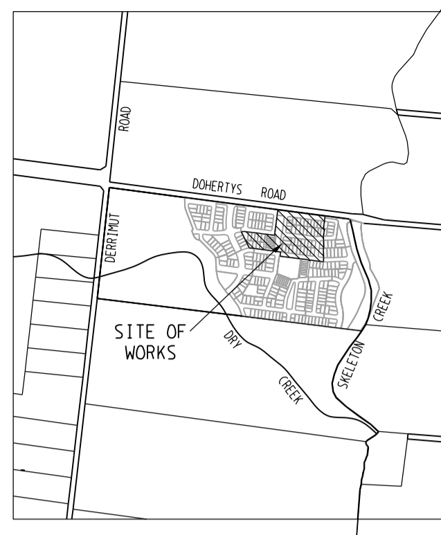
LOCALITY PLAN SCALE 1:20000

WARNING BEWARE OF UNDERGROUND SERVICES THE LOCATIONS OF UNDERGROUND SERVICES ARE APPROXIMATE ONLY AND THEIR EXACT POSITION SHOULD BE PROVEN ON SITE. NO GUARANTEE IS GIVEN THAT ALL EXISTING SERVICES ARE SHOWN.